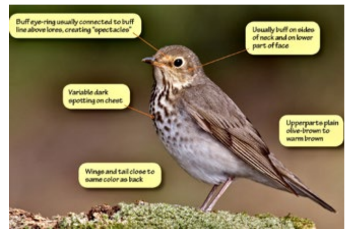
Above: Identifying a Swainson's Thrush

Above: The distribution of the Swainson's Thrush with breeding in pink, migration in yellow, and winter in blue. From "Birds of the World" (2022) Cornell Laboratory of Ornithology, Ithaca, NY, USA.