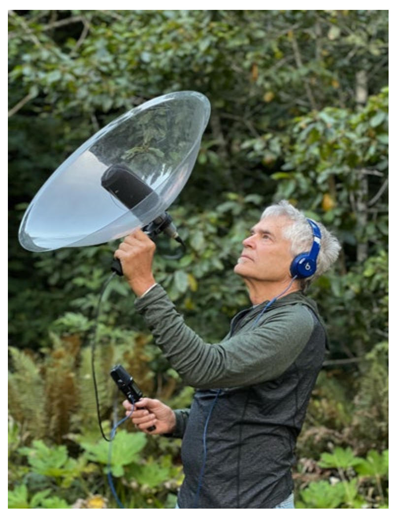
Above: The parabolic dish focuses the sound waves onto the tip of the microphone, and the recorder/amp processes and stores the signal with a time stamp.

To learn more, visit Robert's website at: www.earbirdinghumboldt.com.