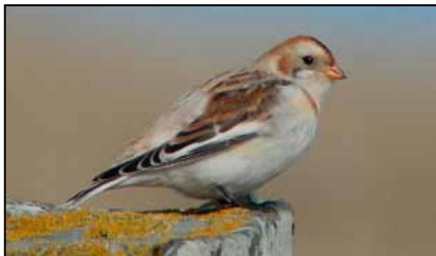
Snow Bunting Bear River Ridge, HUM, © Brad Elvert