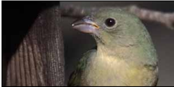
Painted Bunting Arcata, HUM