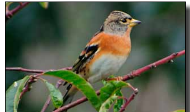
Brambling Arcata, HUM