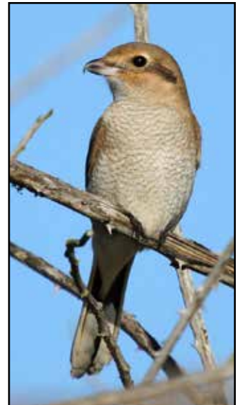
Northern Shrike, Arcata Bottom, HUM

We look forward to seeing you on field trips and at our monthly programs.