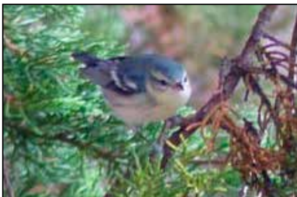
Cerulean Warbler, Samoa, HUM, © Rob Fowler

Emperor Goose: 1, with 2 Greater White-fronted Geese, Smith River bottoms , 6-9 Oct (GA, MOBs), the 1st regional record in 10 years • Arctic Loon: 1, Humboldt Bay entrance , 25-27 Sep (TM, SM, CO), likely the same bird that was reported last period on north Humboldt Bay near Samoa Bridge, would be only the 2nd confirmed record for the region; 1 (same?), Big Lagoon , 29 Sep-25 Oct (TM) • Great Shearwater: 1, MCAS Fort Bragg pelagic trip , 18 Oct (RF, TE, MOB), found only in Atlantic waters; participants were stunned and elated to see this species in a mixed raft of shearwaters about 12 mi offshore of Fort Bragg in Northern Mendocino county, 1st regional record and one of <20 for the state • Black-vented Shearwater: 1, 4 Oct, was seen from the North Jetty during a well-attended daylong BBQ/birding event; 6 Oct, a report came from the Mendocino coast of up to 100 per-minute flying north just offshore, 7 Oct, offshore between Humboldt and Del Norte counties, thousands streamed by. This species, which breeds off the coast of Baja, is rarely seen north of Sonoma County. With such big numbers, we can hope to spot it on our local Christmas Bird Counts • Brown Booby: 1, North Jetty , 16 Oct (TM, SB, BE, CD); 1, MCAS Fort Bragg pelagic trip , 18 Oct (MOB). Booby reports were already