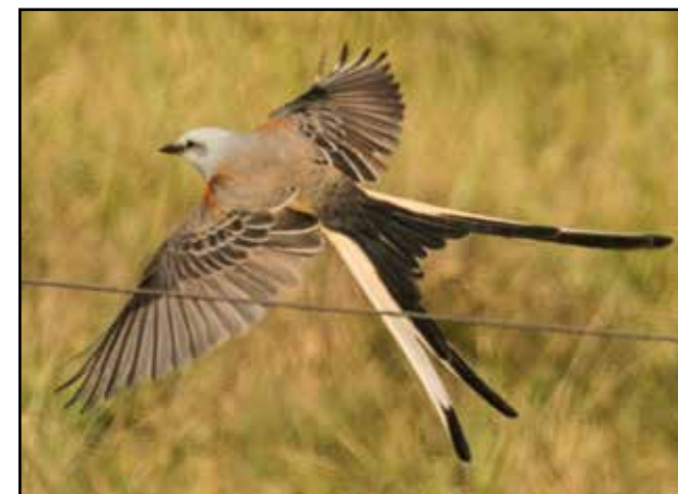
Scissor-tailed Flycatcher, Arcata Bottom, HUM, © Matt Lau

As this goes to the editors, 3 Snow Buntings have been observed in the region (details in the next issue), including 1 in the company of Snowy Plovers at Clam Beach! There have been a few reports of Snow Goose .