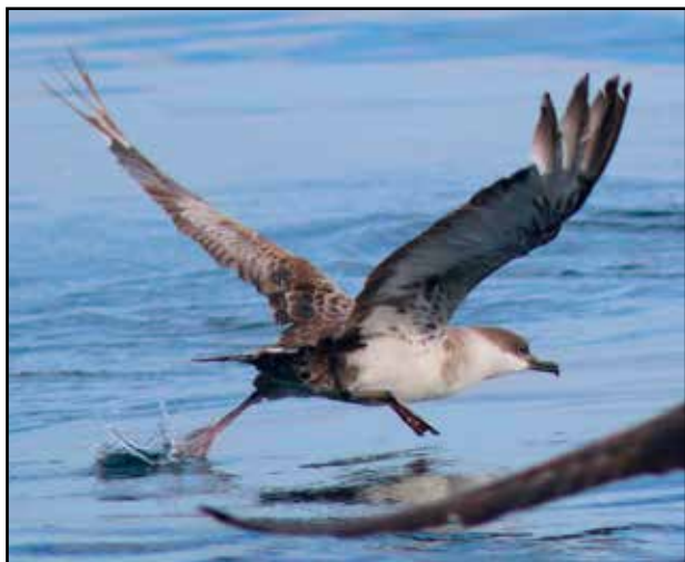
Great Shearwater, Off Fort Bragg, MEN, © Sean McAllister

Emperor Goose: 1, with 2 Greater White-fronted Geese, Smith River bottoms , 6-9 Oct (GA, MOBs), the 1st regional record in 10 years • Arctic Loon: 1, Humboldt Bay entrance , 25-27 Sep (TM, SM, CO), likely the same bird that was reported last period on north Humboldt Bay near Samoa Bridge, would be only the 2nd confirmed record for the region; 1 (same?), Big Lagoon , 29 Sep-25 Oct (TM) • Great Shearwater: 1, MCAS Fort Bragg pelagic trip , 18 Oct (RF, TE, MOB), found only in Atlantic waters; participants were stunned and elated to see this species in a mixed raft of shearwaters about 12 mi offshore of Fort Bragg in Northern Mendocino county, 1st regional record and one of <20 for the state • Black-vented Shearwater: 1, 4 Oct, was seen from the North Jetty during a well-attended daylong BBQ/birding event; 6 Oct, a report came from the Mendocino coast of up to 100 per-minute flying north just offshore, 7 Oct, offshore between Humboldt and Del Norte counties, thousands streamed by. This species, which breeds off the coast of Baja, is rarely seen north of Sonoma County. With such big numbers, we can hope to spot it on our local Christmas Bird Counts • Brown Booby: 1, North Jetty , 16 Oct (TM, SB, BE, CD); 1, MCAS Fort Bragg pelagic trip , 18 Oct (MOB). Booby reports were already