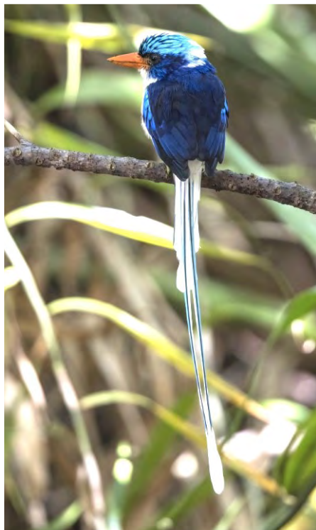
Common Paradise Kingfisher