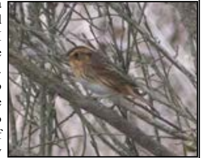
Photo of Nelson's Sparrow